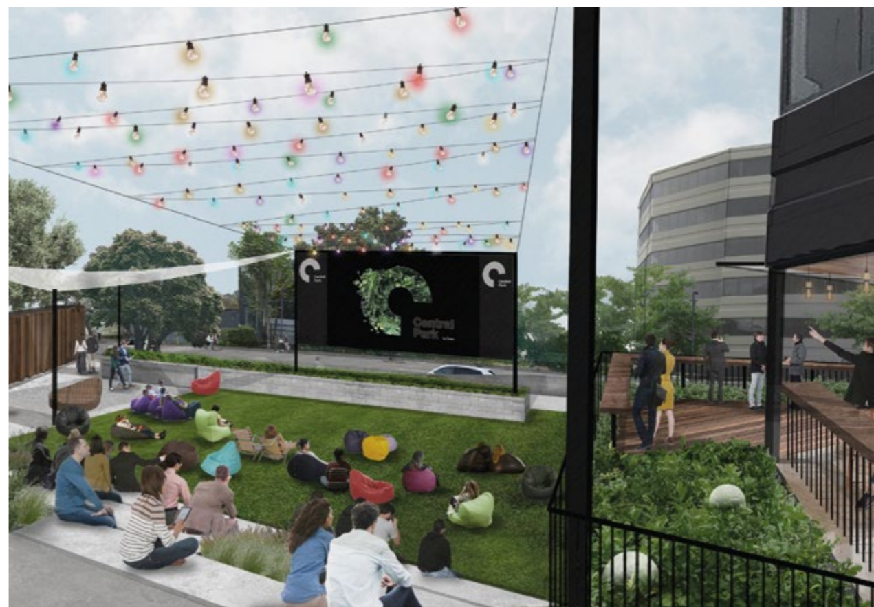
Indicative imagery of conceptual vision only by CAAHT Studio Architects.