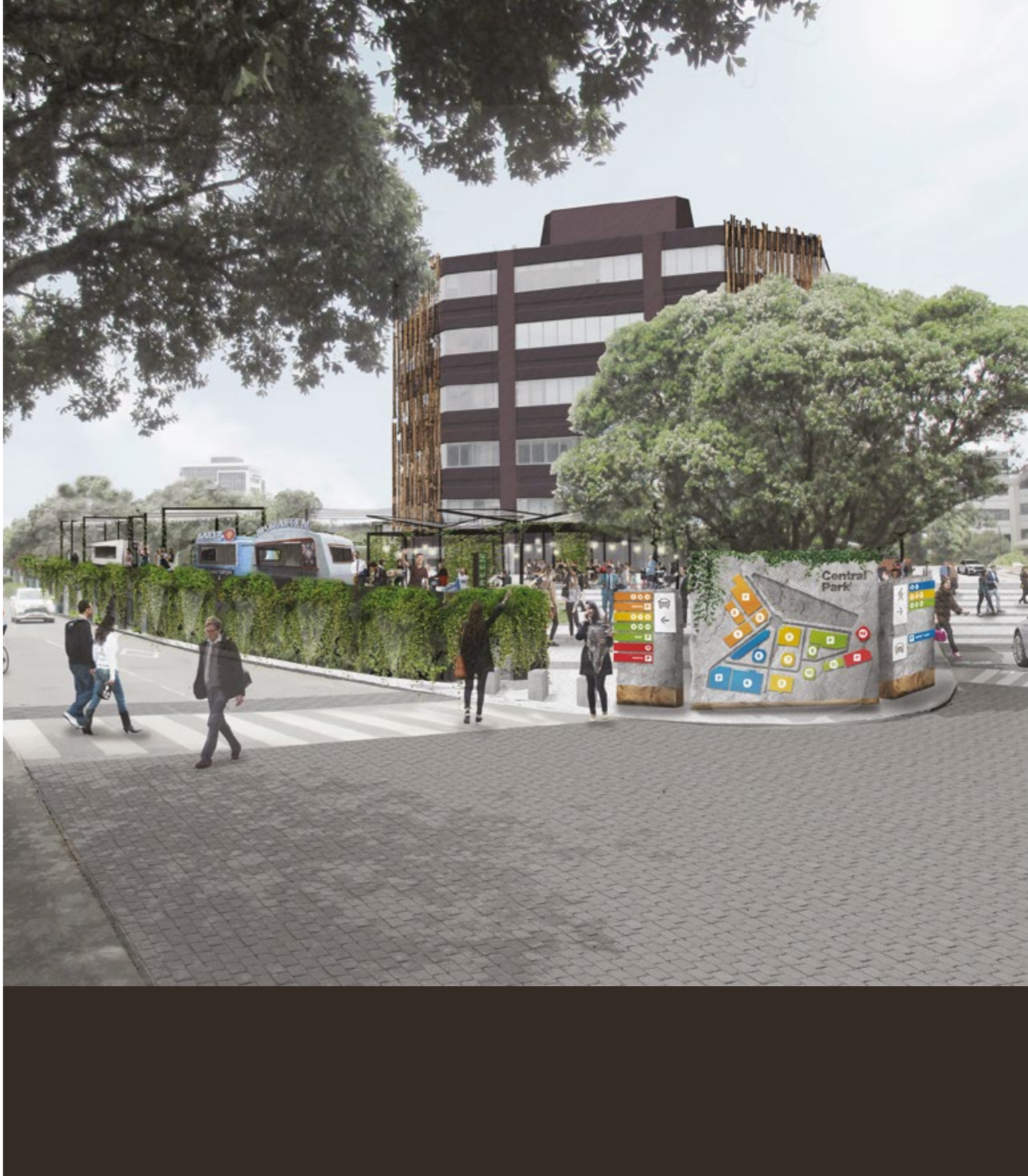
Indicative imagery of conceptual vision only by CAAHT Studio Architects.